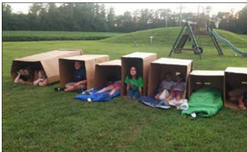
(Below) Youths at Melrose UMC in the Northern Neck of VA got a taste of homeless living by spending a night in a box before serving the homeless in Richmond through Teens Opposing Poverty.