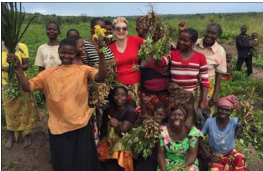
A lovely welcome and blessing at a Food Resource Bank sites in Kamina, Democratic Republic of the Congo. Here, the farming co-op was female led, and the women asked for a "Mama School" to learn to read and write as part of their strategic plan.