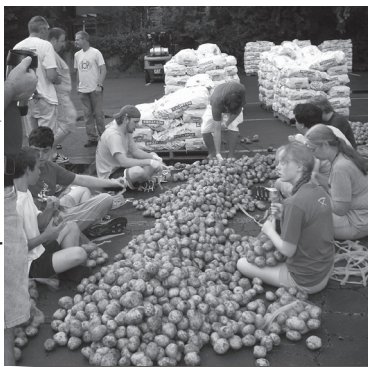
POTATO PARTY: About 130 volunteers showed up in the early hours for the annual 'Potato Drop.'

By 5:30 a.m., an estimated 130 volunteers from Annual Conference, including about 30 youth, were on hand to tackle the project. Within two hours, the volunteers had re-bagged the potatoes into 10-pound mesh bags, then loaded them into the vehicles of 18 regional feeding agencies that are giving them