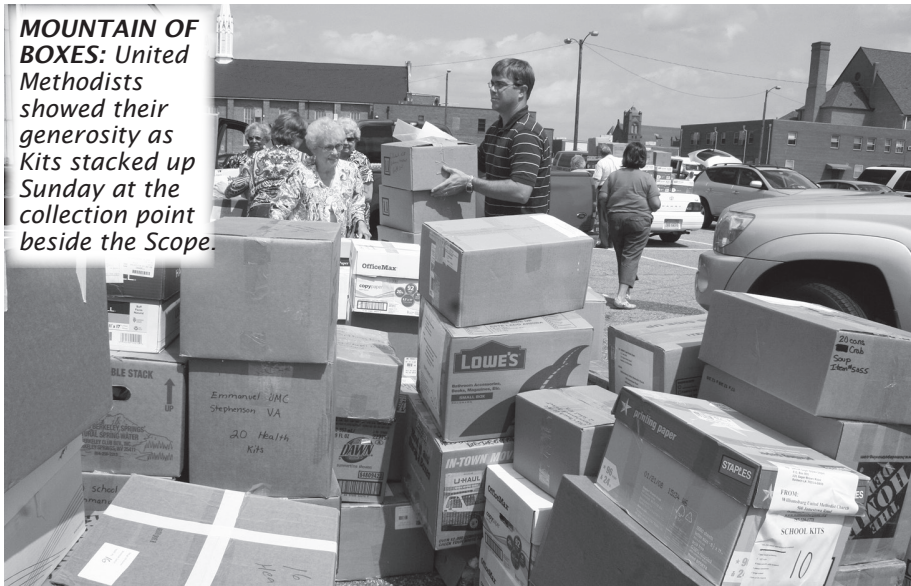
MOUNTAIN OF BOXES: United Methodists showed their generosity as Kits stacked up Sunday at the collection point beside the Scope.